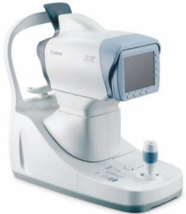
TX-20P Full Auto Tonometer & Pachymeter