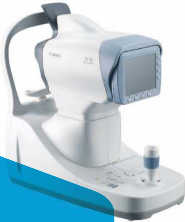
TX-20 Full Auto Tonometer

Fits easily on any instrument table and allows for maximum patient interaction