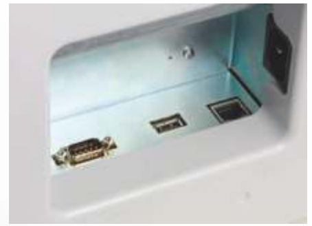
Extended connectivity USB host for inputting patient info by keyboard/barcode reader. LAN and RS-232C for connection to network. XML file output via LAN.