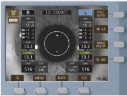
Multifunctional switches placed around the screen with a simple and logical function indication.