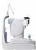
CR-2 Plus AF