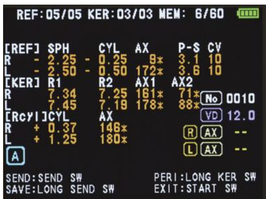
Full summarize measurement screen